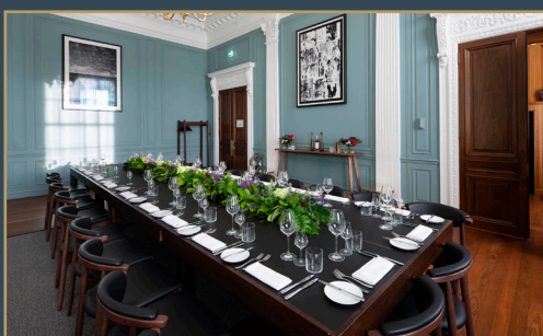
The Games Room - for up to 50 people

Elevate your corporate gatherings with our Day Delegate Rates at Cheval The Edinburgh Grand. Our spacious meeting rooms - The Games Room and The Directors' Suite - come equipped with a projector and screen or LCD TV available as required, flipchart, registration desk and wi-fi access to ensure a smooth running and productive day.