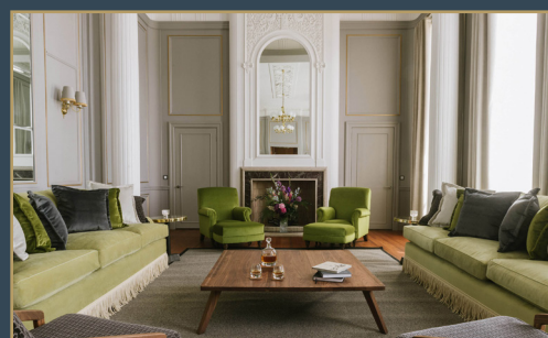
The Directors' Suite - for up to 20 people